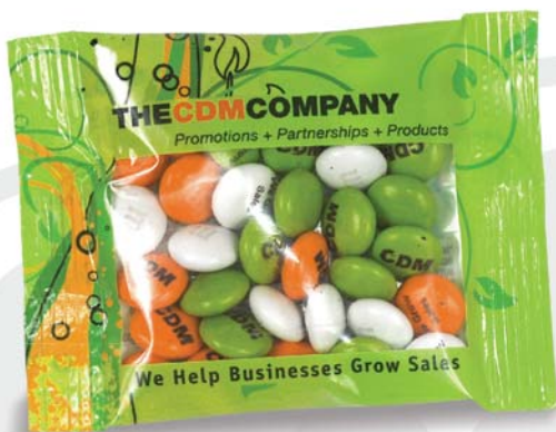
Sizes available: 1/2 oz, 3/4 oz or 1.0 oz

You can create any design within the specifications of our templates or you can forward us your artwork and we will develop a bag to your specifications. Below are some examples. Let your creativity be your guide.