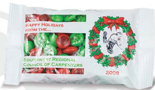
Size available: 2.0 oz