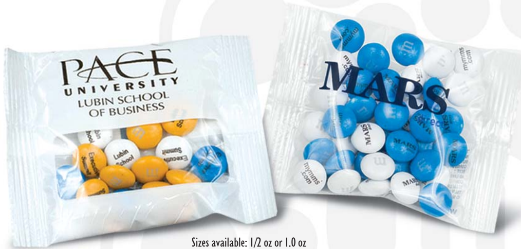
Sizes available: 1/2 oz or 1.0 oz

Our one-color personalized packaging is available in clear or white only with window as shown below. The packaging imprint is available in one of four colors: blue, black, red or white.